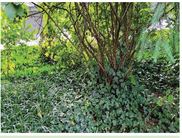
Pictured above is a bunch of ivy. Mosquitoes crawl under their leaves emerging during the cooler parts of the day.