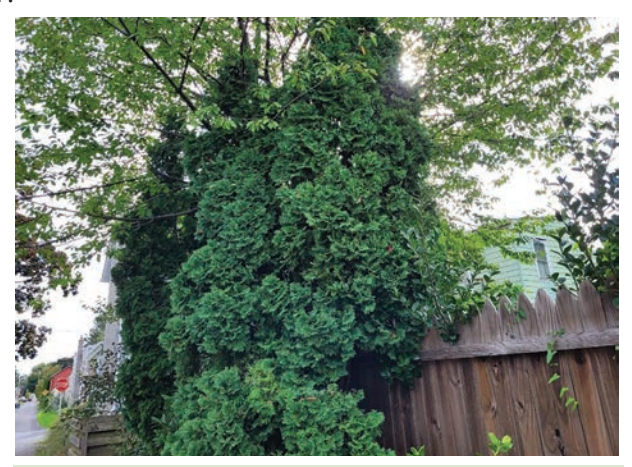
Pictured above is a juniper bush which provides a lot of shade inside of its bushy leaves which mosquitoes use to shield themselves from the sun.

The final draw to your yard may be cool damp areas in general. These areas could be stacked branches or piles of leaves left from the fall or just general rubbish piled up that hasn't been tossed out yet. Even though there isn't any pooling water in some of these locations to lay eggs, they provide enough shade to give the mosquitoes shelter during the hot summer days. The best course of action is to properly store and dispose of anything that can give these pest shelter.