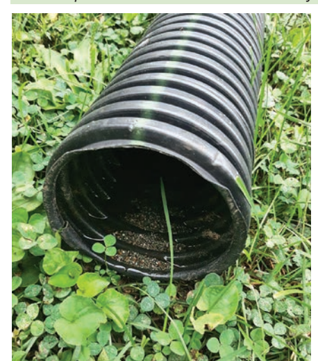
Pictured at left is a corrugated pipe. The ridges in this pipe hold enough water for mosquitoes to lay their eggs in.

Pictured at right are clogged gutters. The water that stays in these gutters are perfect places for mosquitoes to lay their eggs.